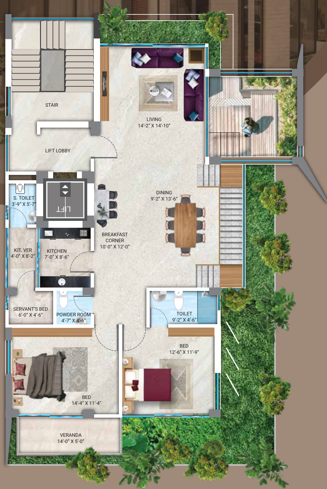
ROAD LOWER FLOOR